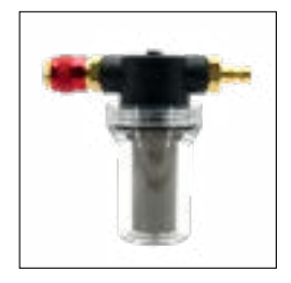
External Coolant Filter (optional) P/N 850.1039