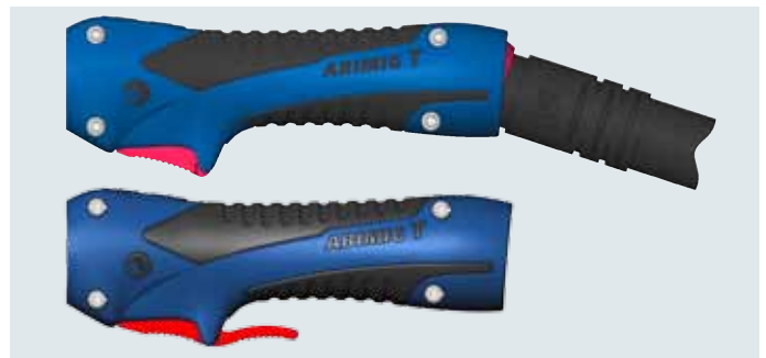
Standard and extended trigger handle options.